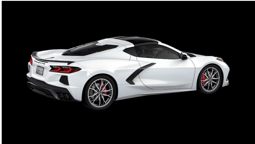
2025 Arctic White Corvette Coupe Price: $20.00 Unlimited Raffle Drawing: April 26, 2025 2:00 PM Central Time

To purchase any of these raffle tickets, you must go to the NCM website, download the raffle ticket form, and mail it. The museum will confirm your purchase.