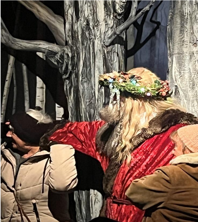
CHRISTMAS CAROL TROLLEY RIDE