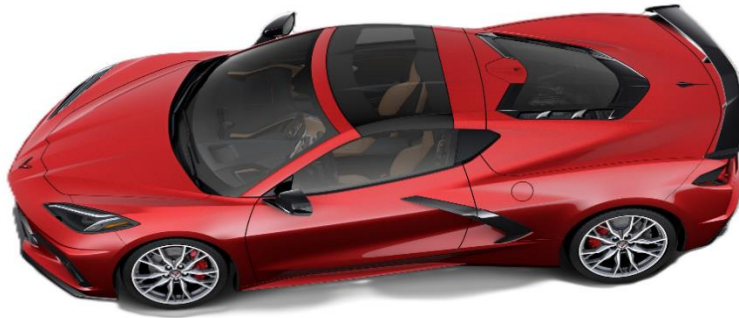
2025 Red Mist Corvette Coupe Price:$150.00 Tickets: 1500 Drawing: Feb 13, 2025 2:00 PM Central Time