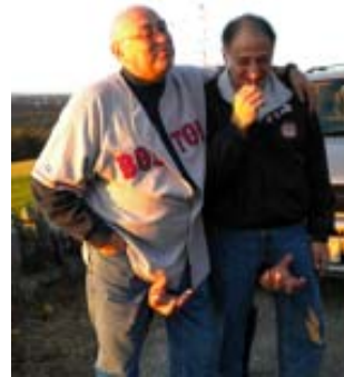
“The hand is quicker than your eyes”