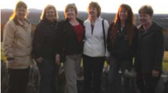
“Don’t we look pretty?”