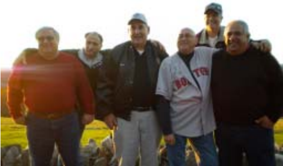
“Look over here!” “Ya, three cameras at once”